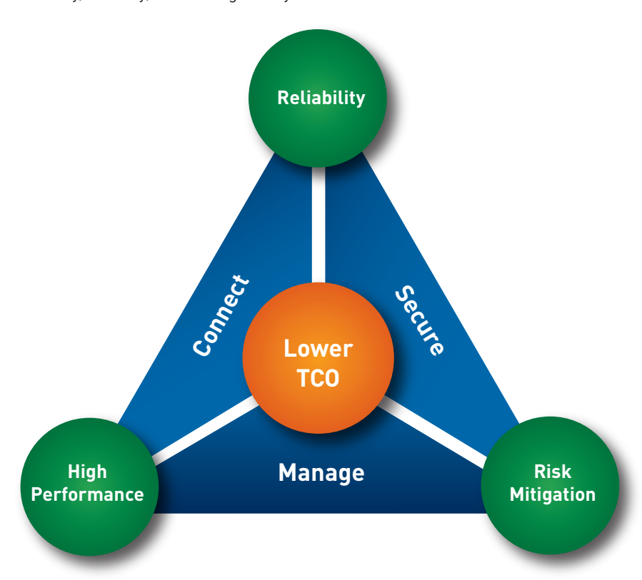
Figure 1: Juniper Networks delivers IT services without boundaries at lower TCO by delivering network-wide consistent connectivity, security, and management leading to increased network performance, reliability, and mitigated risk for campus networks.

With a comprehensive portfolio of products for the campus, all of which run on a single operating system and can be managed centrally by a single network management application, Juniper Networks reduces the cost and complexity of campus networks to maximize revenues and to enhance employee productivity, client satisfaction, and customer retention. This is accomplished by providing industry-changing IT services for connectivity, security, and manageability.